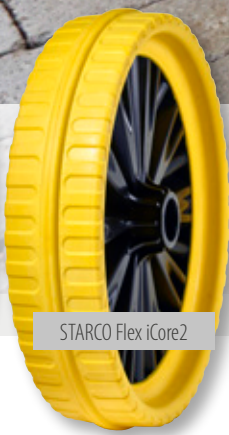
STARCO Flex iCore2